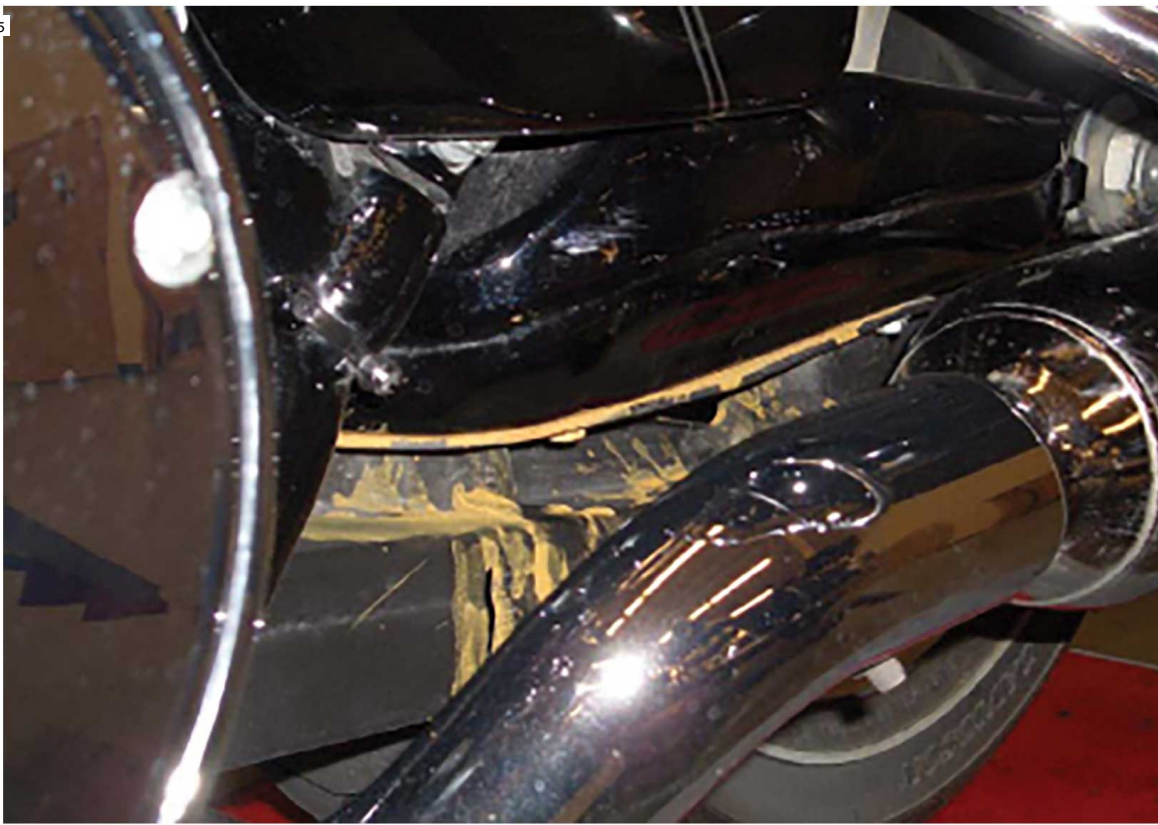
Figure 1. Rear Fork