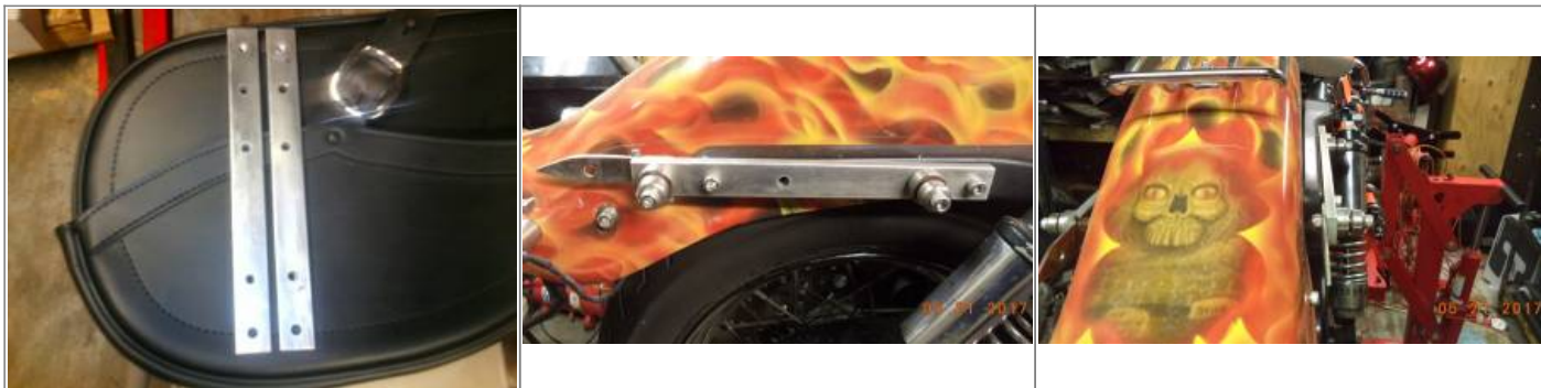
Aluminum flat bar (1"x3/8"x10-7/16") to move the holes backwards w/ Easy Mount bushing bolts tapped into the bar. Turns relocated. 9)

Just about any bag can be mounted on any bike. It depends on a lot of variables you need to figure out before attempting a custom mount. Factors including looks (high/ low position as well as the dimension between the fender and the bag). Some people do not mind a gap between the bag and the fender and some will not like it at all. Other factors to consider are passenger leg room, rear turns position, ground clearance and, of course, the main reason for installing bags is to carry more stuff with you than what you can fit in your pocket. Below are some pics of custom mounts for saddlebags. Click on a pic to enlarge.